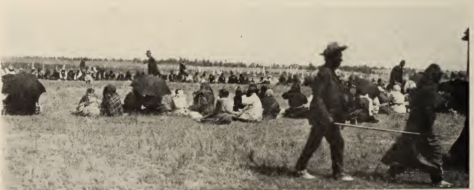
The feast, Sunday at noon. In the foreground to the right is an Indian woman leading her blind husband